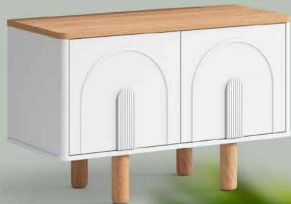
UNIT SIDE BLOCK