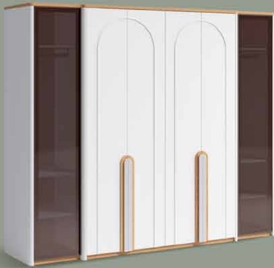
WARDROBE W: 266 cm D: 85 cm H: 227 cm