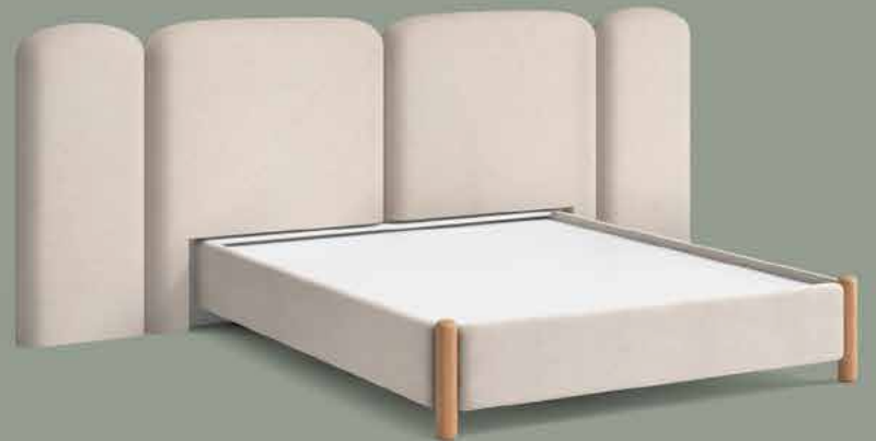
BED W: 318 cm D: 213 cm H: 125 cm