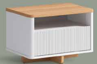
BEDSIDE TABLE W: 65 cm D: 48 cm H: 46 cm