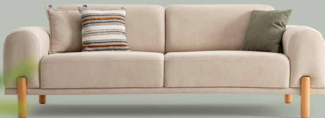
3 SEATER SOFA