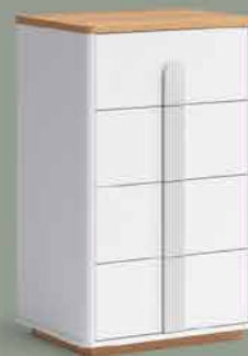
CHEST OF DRESSER W: 65 cm D: 47 cm H: 102 cm