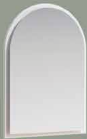
MIRROR G: 65 cm D: 3 cm Y: 85 cm