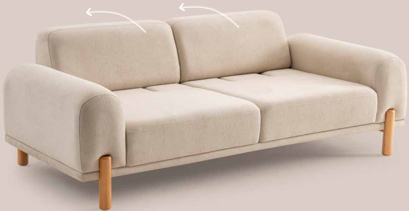
Single Bed & Tv Session