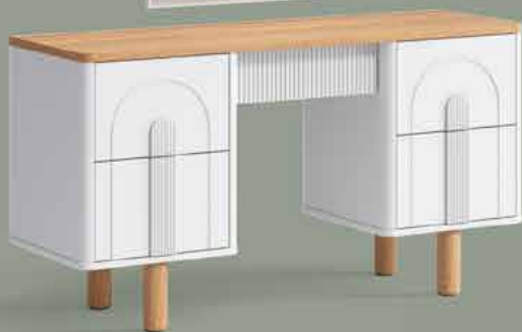
DRESSER W: 148 cm D: 47 cm H: 80 cm