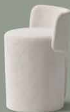
POUF W: 41 cm D: 43 cm H: 57 cm