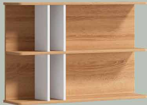
UNIT UPPER BLOCK